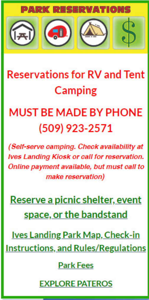
Reservation System Banner on Pateros.com